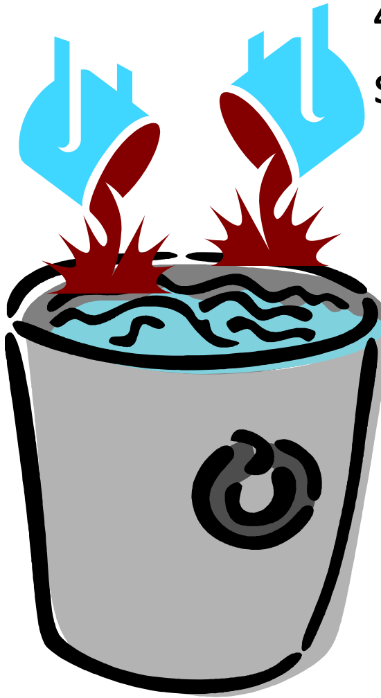
General Fund bucket